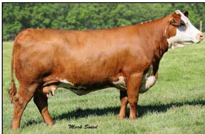
LOT 222 DAM