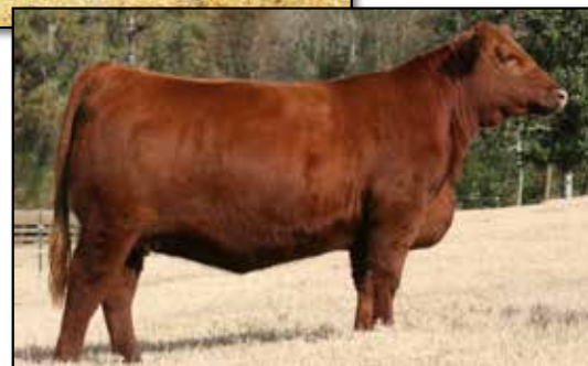
LOT 322 EMBRYO DAM