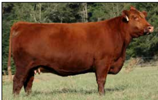
LOT 319 EMBRYO DAM