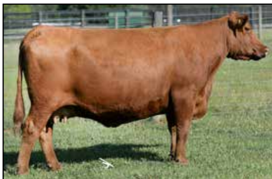
LOT 320 EMBRYO DAM