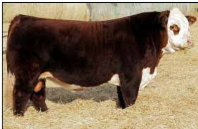
LOT 222 SIRE