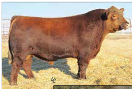
LOT 322 EMBRYO SIRE